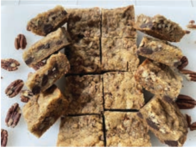
Toasted Pecan Maple Blondies

When it comes to sweets, there are few I don't like, but brownies are one of my favorites. If they have nuts, even better! If you haven't tried the brownies from Sprouts Farmers Market bakery section, they are delicious and hard to beat. We often buy one or two when we shop there. But a few weeks ago, I was craving the caramel flavor of a blondie with pecans.